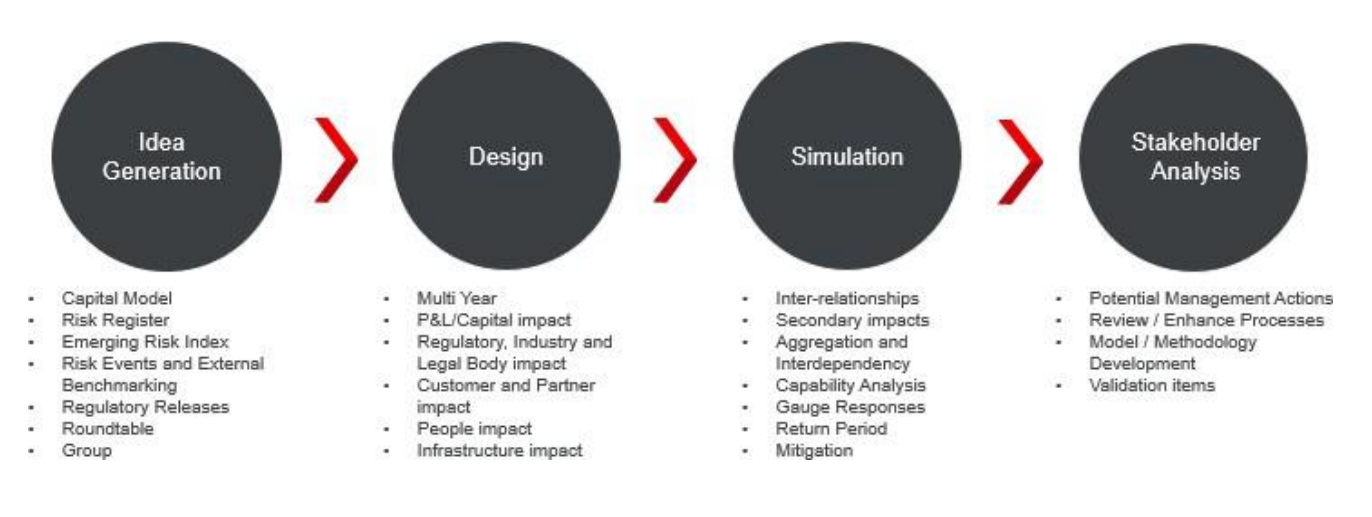
Figure A: Overview of the Stress and Scenario Methodology

<u>Scenario testing</u> is typically used to assess (forward-looking) the simultaneous impact of a set of events. Stress and scenario analysis maintains a close relationship with the capital model. Well-functioning scenario analysis requires a robust model and methodology to perform the analysis, at the same time, the results of Stress and Scenario testing can inform refinements to the model and/or stress and scenario methodology.